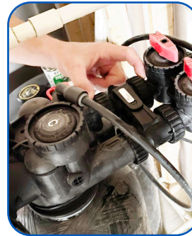
A blending valve installed between a softener control valve and bypass valve.

Softener service providers partially open or close blending valves to control hardness levels.