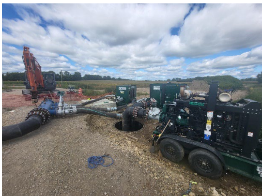
Existing Flow Bypass Set up – Needed to Switch Flow into the New Pipe