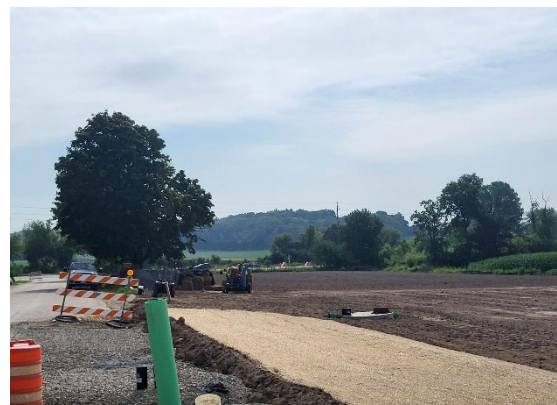
Seed Restoration along Kennedy Drive