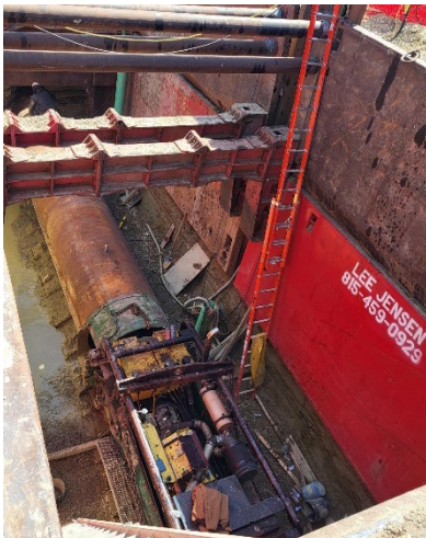
STH 113 Bore