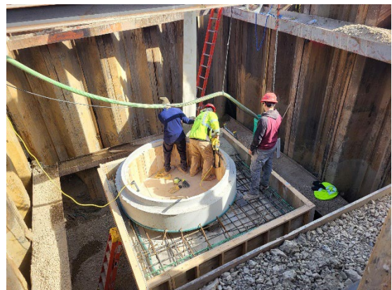
Cast-in-Place MH14-535 Construction