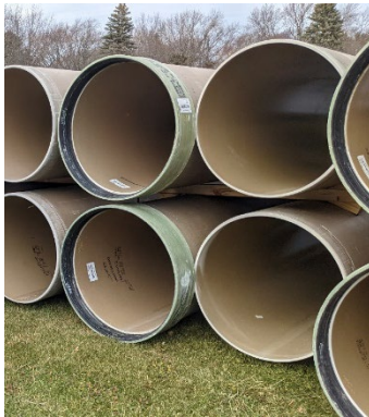
Hobas Pipe – Planned Pipe Material