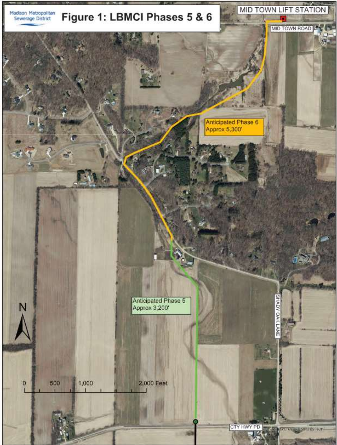
Figure 1: LBMCI Phases 5 & 6