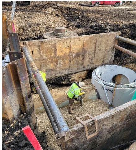
Pipe and Manhole Connection