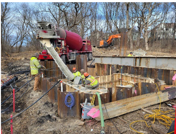
Cast-In-Place Concrete Structure at North Connection to the Existing Interceptor