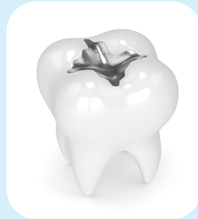
EXTRACTED TEETH THAT CONTAIN AMALGAM

Both contact amalgam (has been in contact with a patient) and non-contact amalgam (scrap that has not been in contact with a patient) should be treated as amalgam waste.