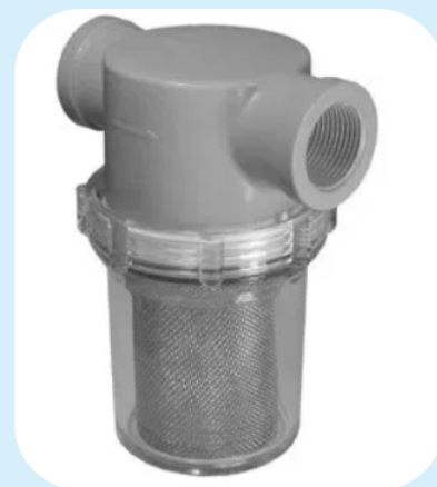
VACUUM PUMP FILTER CONTENTS

If a material not on this list is contaminated with amalgam or amalgam-containing sludge, treat it as amalgam waste and place it in the amalgam collection container.