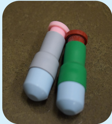
USED AMALGAM CAPSULES