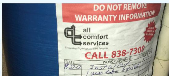
Softener label with the year it was installed

If you don't know offhand when your softener was installed, check the unit for labeling, like a tag or sticker, that indicates when your softener was installed.