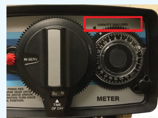
Control head with Gallon-labeled capacity dial