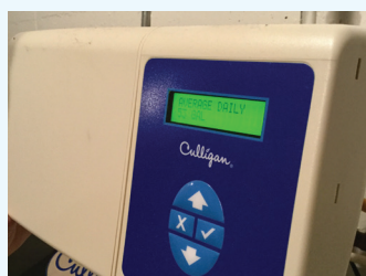
Example brand labeling: This control head and tank below indicate the unit is a Culligan softener

You also may find additional information on stickers or other labels on your softener-- look all around the softener, including behind the control head, for this information.