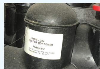
Example model labeling: Softeners are labeled differently. Here, the softener's model (H100) is identified on a sticker behind the control head.

Evaluate your softener at link.madsewer.org/self-screen-tool